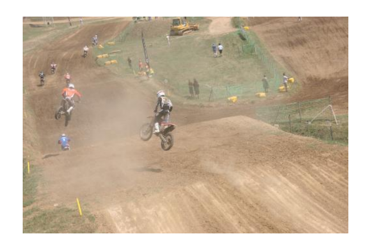
Below: Plenty of corners to rail.